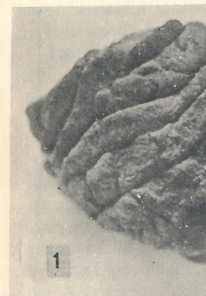
Fig. 1 - Hun

The bigger fragments were then separated under an entomological microscope and the parasitological examination was performed by the spontaneous sedimentation method developed by Lutz (1919). Slides were made at regular intervals and the last one 24 hours after the beginning of sedimentation. The remaining sediment was